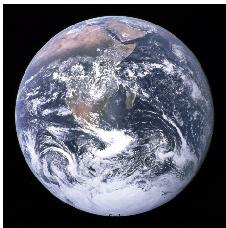
of the Apollo 17 spacecraft

Does this longing for a space resemble the way in Lars Van Trier's Melancholia (2011) Justine builds a 'magic cave' for Leo, to keep the forces of chaos (and extinction) outside? Only a couple of years before Huygens discovered that 'dark triangular area' on Mars, another philosophical forefather pushed another dark button, precipitating a development that would haunt Western logocentric thinking in the ages to come. To remain out of that ever-tempting 'kingdom of darkness', i.e. to control our fears and violent inclinations towards ourselves and others, one needs, according to the moral philosopher Thomas Hobbes, to install the Leviathan as the demiurge of society. Interestingly – and that's how half-truths thrive, on stories half-told – Hobbes, in his visionary Leviathan (1651), also links this anxiety to curiosity in the seeking of causes and in coming up against invisible powers. This is no small 'dark matter': to break open the endless repetitive cycle of wandering around in guilt and pain, to use Žižek's words, or, even to divert the catastrophe (absolute darkness), there's a curiosity that pushes boundaries and imagines – in the depressive though 'beautiful' logic of Von Triers movie again – a 'blue sphere of Melancholia' approaching from behind.