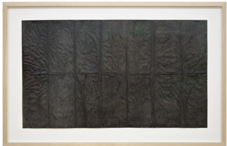
The fall and rise and fall... (2012 Soprintendenza archeologica)

The protagonists are there for us to speak to. Planets and volcanoes serve as ghostlike sources of inspiration, imagination and orientation. Though the volcano is an unmissable presence in any landscape, we humans do not always pick up on its 'signs'. Volcanic action produces a variety of sounds, and many of those are, so it reads in the booklet on Mars II, 'below the lower frequency limit of human hearing'. In this way the volcano sings of a haunting catastrophe, though its song may not be for human ears.