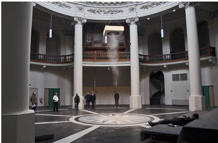
Column, Mt. Saint Helens 1980 © 2017 Karl Van Welden

A haunting catastrophe is never limited to the associated ecological violence and perplexity in itself. The real danger might lie in an overtly aesthetical view of what some tag as the 'anthropocene' – i.e. one that shows spectacular pictures of ecological catastrophe as a result of human geo-engineering. 8 Is that the reason why there are no humans to be 'seen' in Van Welden's work, except for one virtuosic pianist? Maybe. However, more than looking for an alternative visual representation of our interventionist role as humans, Van Welden's artistic planetarium patiently builds up the momentum to expose something like an 'aesthetics of silence', reminiscent of Susan Sontag's seminal essay of the same name from